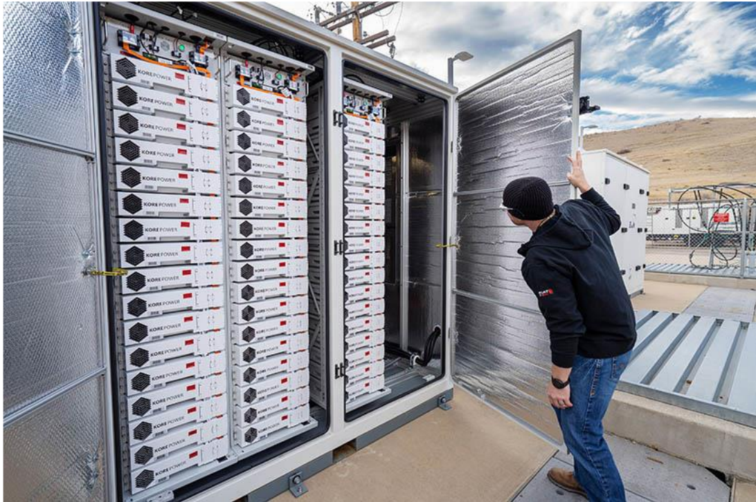
Plate 1-5: BESS access from the outside