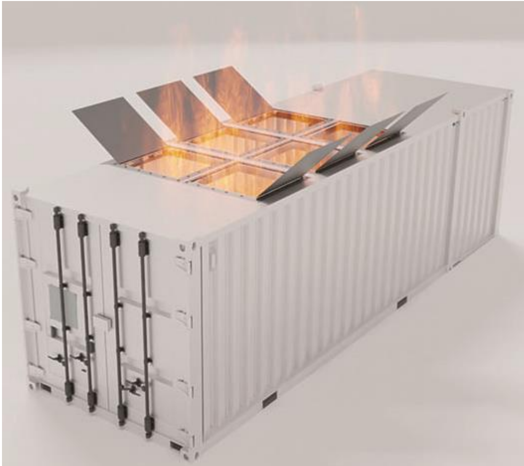
Plate 1-4: Sample deflagration venting on BESS container